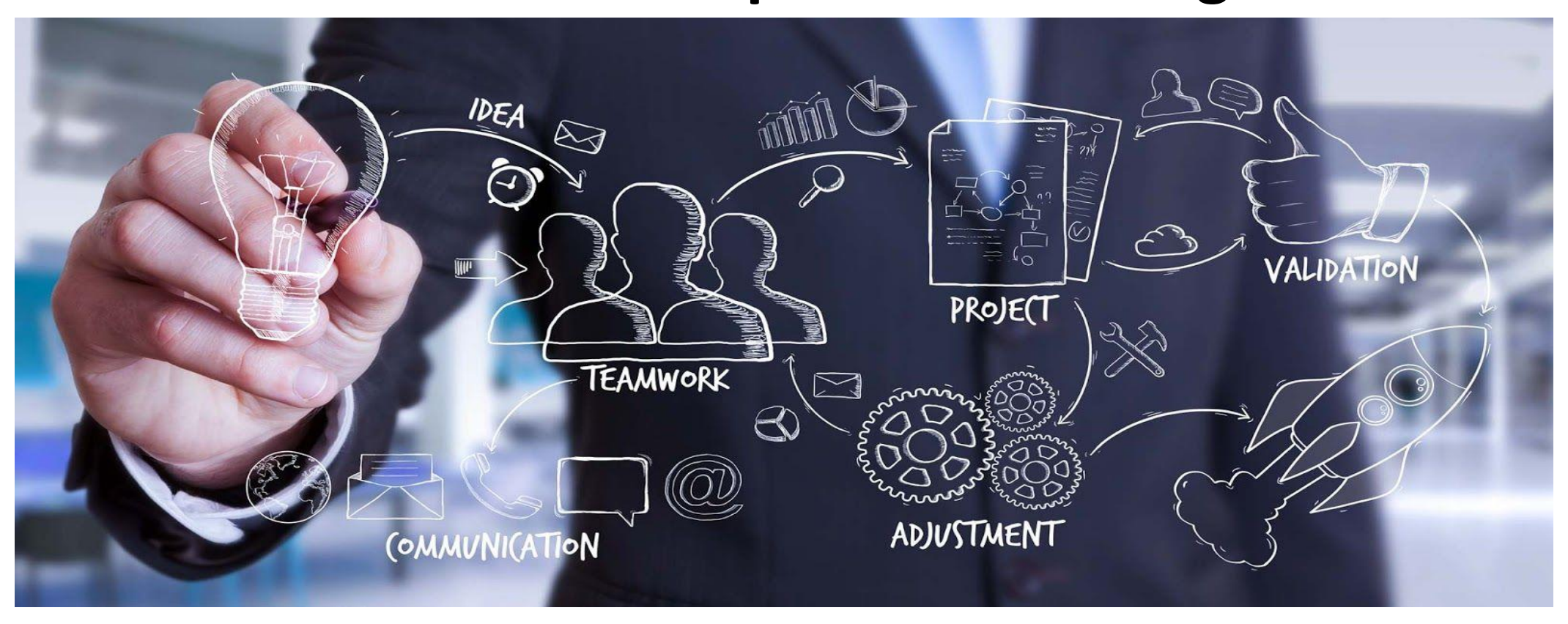
We can Safely Guiding You to Your Full Potential